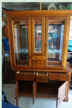
Beautiful vintage hutch

Free, no obligation Q & A. For more info, call 307-399-0940.